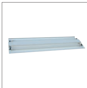
Corp fluorescent tip OCTANORM EUR 20.00 cu doua tuburi D-171 Cod 019.010.200.000