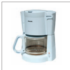
Filtru de cafea EUR 4.00 Cod 025.010.120.010