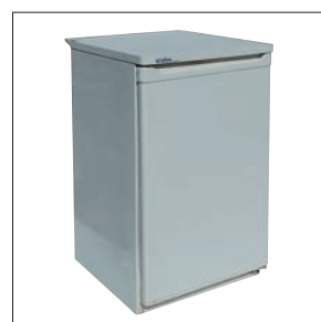
Frigider ARCTIC (180 l) EUR 44.00 Cod 025 010 070 020