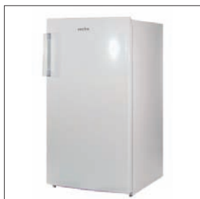
Frigider ARCTIC FB 155 EUR 25.00 Cod 025 010 020 198