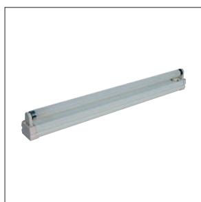
Corp fluorescent tip SS30 EUR 18.00 cu un tub D-170 - A Cod 019.010.190.001