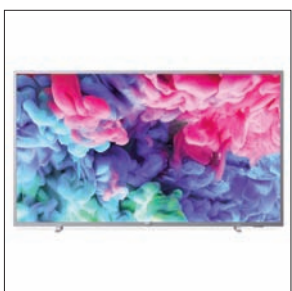
TV LED SMART 4K, UHD ultrasubtire EUR 40.00/zi (diagonala ecran: 126 cm) Cod 025 010 130 045