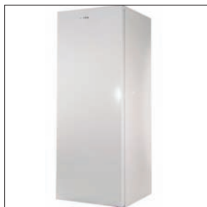
Frigider ARCTIC 255 l EUR 55.00 Cod 025 010 020 199