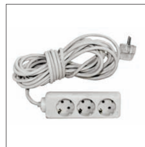
Prelungitor 230V, 10A, 5m EUR 10.00 Cod 019.010.279.000