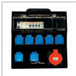
Panou Electric 380V/220V EUR 100.00 Cod 019.010.265.000