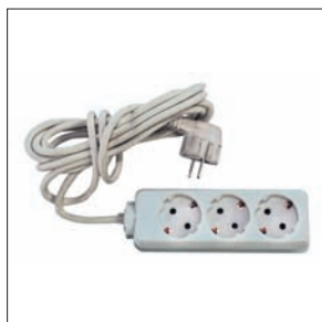
Prelungitor 230V, 10A, 3m EUR 10.00 Cod 019.010.277.000