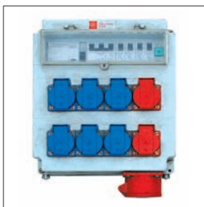
Panou Electric OCTANORM EUR 120.00 Cod 019.010.275.000