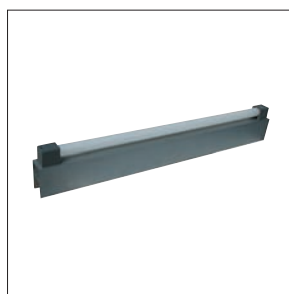
Corp fluorescent tip SS30 EUR 15.00 cu un tub D-170 Cod 019.010.190.000