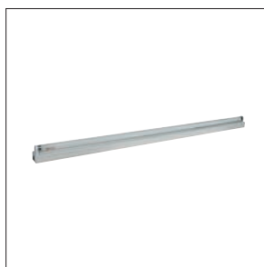
Lampa fluorescenta FIA EUR 15.00 cu instalatie electrica completa 1x40W Cod 019.010.110.000