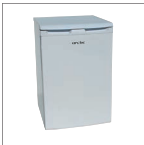
Racitor (140 l) EUR 24.00 Cod 025 010 070 010 (55 x 61 x 84 cm)