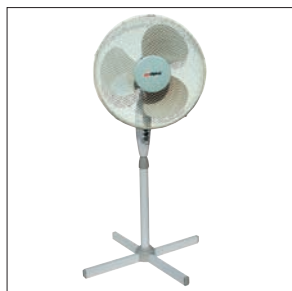
Ventilator cu picior EUR 7.00 Cod 025.010.500.020