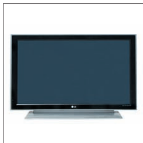
TV Plasma EUR 25.00/zi (diagonala ecran: 107 cm) Cod 025 010 130 040