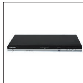
DVD Player EUR 40.00 Cod 025 010 130 030