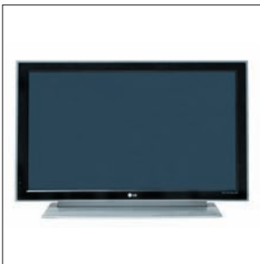
Plasma TV (diagonal screen: 107 cm) Code 025 010 130 040 EUR 25.00/day