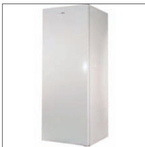
Refrigerator ARCTIC 255 l Code 025 010 020 199 EUR 55.00