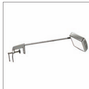
Arm reflector LED A++ 16W 1100LM 4000K EUR 35.00 Code 019.010.200.040