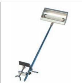
Arm reflector 300W EUR 35.00 Code 019.010.200.010