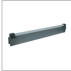
Fluorescent lighting SS30 type with D-170 tube Code 019.010.190.000 EUR 15.00