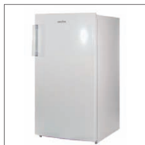
Refrigerator ARCTIC FB 155 Code 025 010 020 198 EUR 25.00