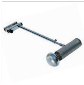
Arm spotlight 100W EUR 12.00 Code 019.010.181.000