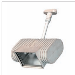
Halogen reflector SYMA STAR 300W EUR 35.00 Code 019.010.200.006