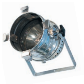
PAR64 500-1000W reflector EUR 40.00 Code 019.010.200.020