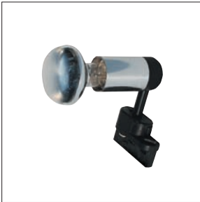
Spotlight 100W EUR 12.00 Code 019.010.188.000