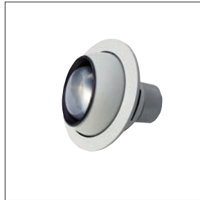
Spotlight 100W EUR 12.00 Code 019.010.170.000