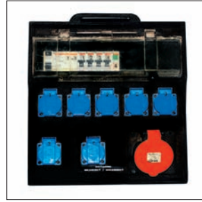
Electrical panel 380V/220V Code 019.010.265.000 EUR 100.00