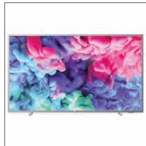
TV LED SMART 4K, UHD ultrathin (diagonal screen: 126 cm) Code 025 010 130 045 EUR 40.00/day