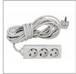
Extension cable 230V, 10A, 5m Code 019.010.279.000 EUR 10.00