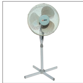
Standing fan Code 025.010.500.020 EUR 7.00