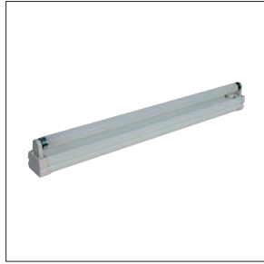
Fluorescent lighting SS30 type with D-170-A tube Code 019.010.190.001 EUR 18.00