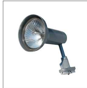
Halogen spotlight SY STAR 100W EUR 15.00 Code 019.010.185.000