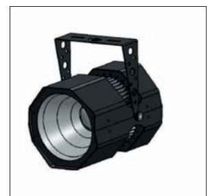
LED VIRGO reflector 40W 4350 LM 4100 K EUR 40.00 Code 019.010.200.045