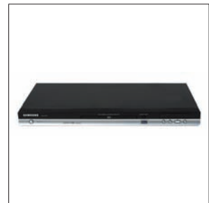
DVD Player Code 025 010 130 030 EUR 40.00