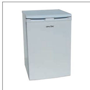
Cooler (140 l) Code 025.010.070.015 (55 x 61 x 84 cm) EUR 24.00