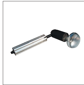
Connecting spotlight OCTANORM EUR 12.00 Code 019.010.187.000