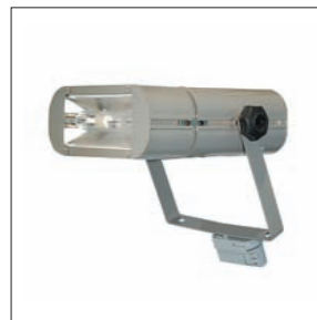
IVEN HQI 150W reflector EUR 35.00 Code 019.010.200.005