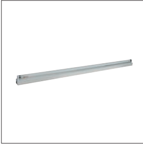
Fluorescent lamp FIA with complete electric installation 1x40W Code 019.010.110.000 EUR 15.00