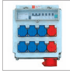
Electrical panel OCTANORM Code 019.010.275.000 EUR 120.00