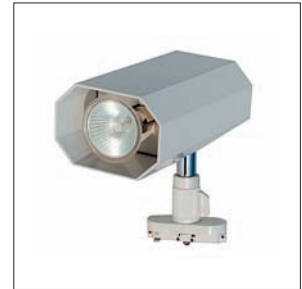
Halogen spotlight SY STAR 50W(A) EUR 15.00 Code 019.010.186.000