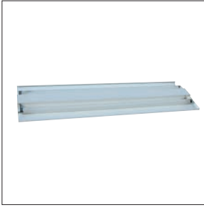
Fluorescent lighting OCTANORM type with double-tube D-171 Code 019.010.200.000 EUR 20.00