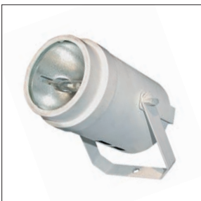
HQI 80W reflector EUR 35.00 Code 019.010.200.030