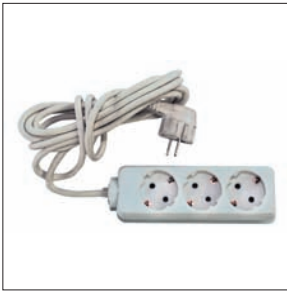
Extension cable 230V, 10A, 3m Code 019.010.277.000 EUR 10.00