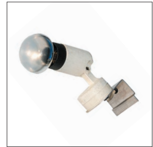
Spotlight SS30 100W EUR 12.00 Code 019.010.200.008