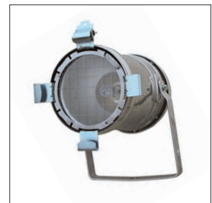
HIGHLIGHT HQI 150W reflector EUR 35.00 Code 019.010.390.000