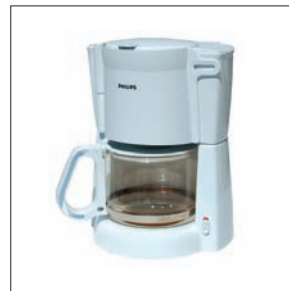
Coffee maker Code 025.010.120.010 EUR 4.00