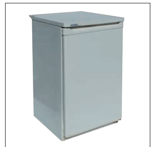
Refrigerator ARCTIC (180 l) Code 025 010 070 020 EUR 44.00