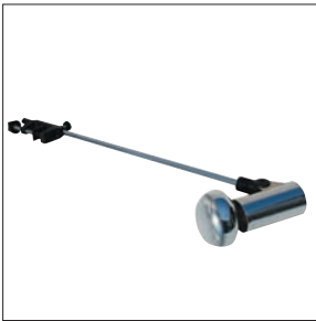
Arm spotlight EUR 12.00 Code 019.010.180.000